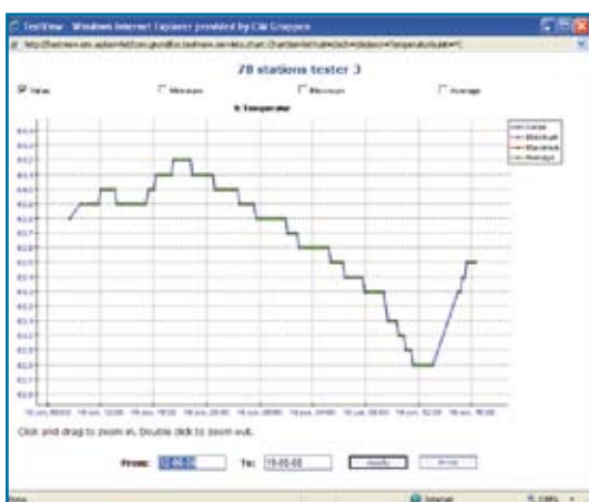
Graphical presentation of log.