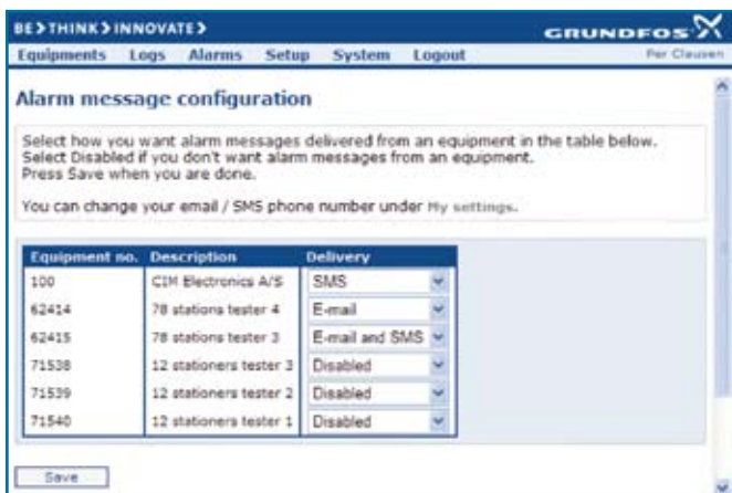
Alarm message configuration.